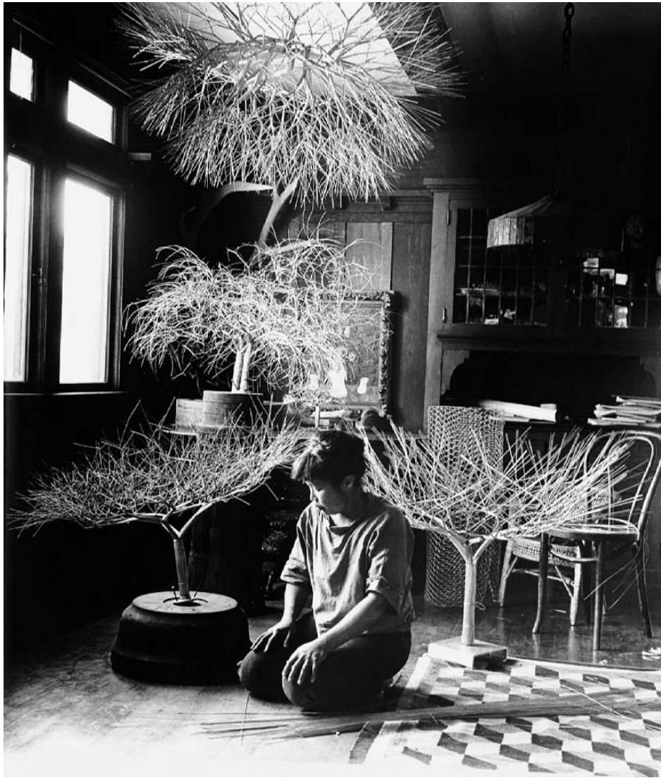
Ruth Asawa kneeling on the floor of her dining room with tied-wire sculptures, 1963.

Marguerite Wildenhain), San Francisco Museum of Art, 1954 § São Paulo Biennial Exhibition, Brazil, 1955 § The Whitney Sculpture Annual , Whitney Museum of American Art, New York, 1956, 1958 § Made in California: Art, Image, and Identity, 1900–2000 , Los Angeles County Museum of Art, 2000